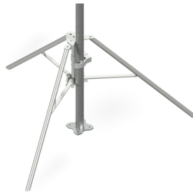
Galvanised folding tripod. Lightweight and compact, our tripod can offer stability when assembling or disassembling the Dynaton Acrow Props. Can also work for props from other conventional systems.