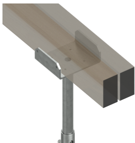
Single and Double U-heads provide extra support for bearers sitting on top of our Dynaton Acrow Props. To install on the prop, the stem of the U-heads slide inside the inner tube of the prop. Most type of bearers can fit within the single (W110mm x D200mm) or double (@200mm x D180mm) U-heads. Mainly for LVL bearers, our U-heads can also support many other beams as long as they can sit and fit properly on them. Dynaton also offers a wide range of LVL bearers . They have been tested for Australian/New Zealand Standards. Please contact us for availability.