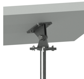
Swivel Head. Ideal for supporting sloped precast slabs, like parking ramps, precast stairs flights, or retaining walls. Our Swivel head provides a full 90° rotation adjustment.

Acrow Prop # 4 | 30.4kg (3,200mm to 4,950mm)